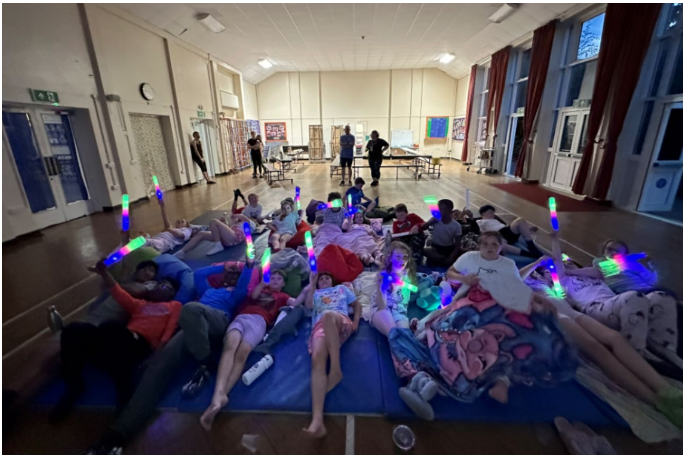
Year 5 in the Hall watching the Minecraft Movie