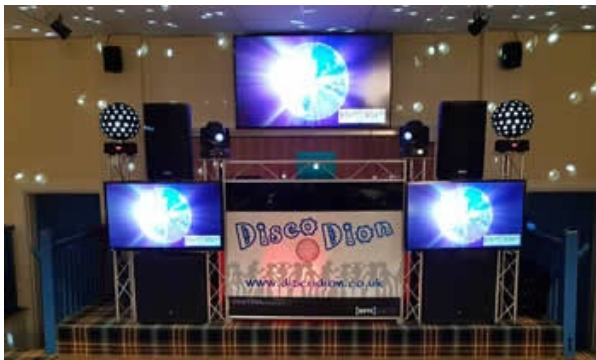
Christmas Disco – Disco Dion - Friday 12th December