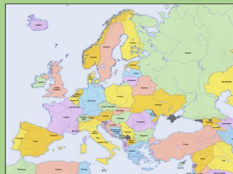
Political map of Europe