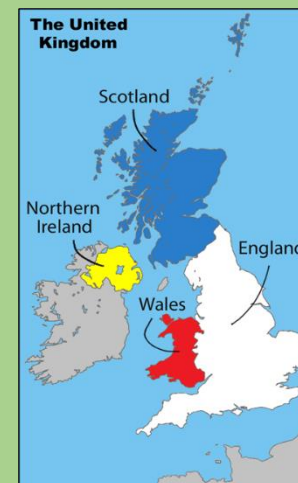
Outline map of the UK