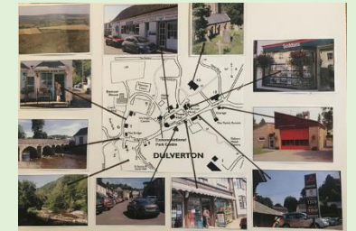
Street plans of my locality