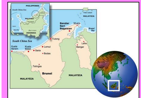
The Nation of Brunei in South East Asia