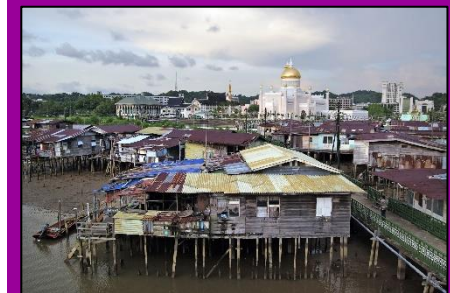
The Village of Kampong Ayer, Bandar Seri Begawan