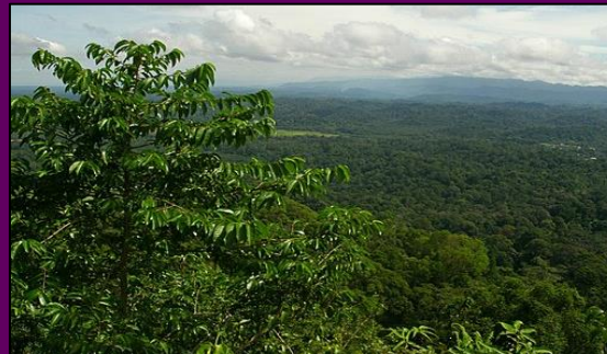
Tropical Rain Forest