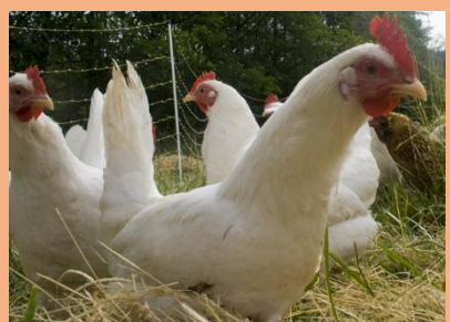
Free range chickens