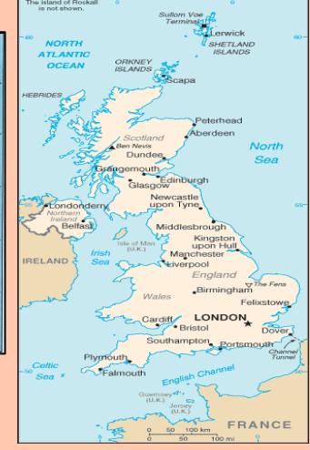
The United Kingdom