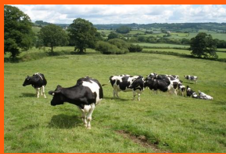
Devon, The United Kingdom