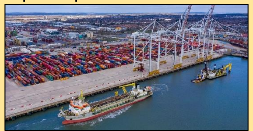
Port of Southampton