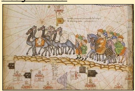
The Silk Road