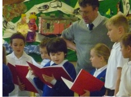
Above: Some of Year 4 sharing their work in Book Week Celebration Assembly. Below: Acorn showing off their Character Day costumes

All in all it was an amazing week and we all enjoyed it a lot.