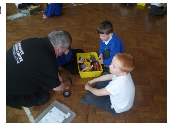
Children working with our scientist visitor.

ing some fun experiments with rockets. We also had a brilliant assembly on Marie Curie and how she saved millions of lives by discovering and applying radiation to patients with cancer. The whole school had amazing fun and learnt something new and fascinating throughout the whole day.